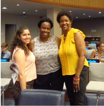
HDFS students at the IDF Observance, UN Headquarters, May 18, 2017