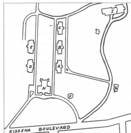
QUEENS COLLEGE CAMPUS 1937

On the other hand, members of the Department maintain an outward-directed, professional commitment to their individual disciplines. They publish professional books and articles, attend