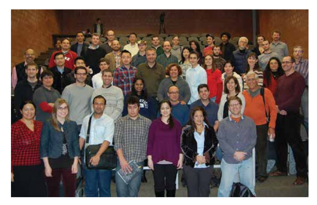
Biology Research Symposium 2012 attendees

The Meléndez lab uses the genetic model Caenorhabditis elegans to study the role of autophagy in early development and metabolism. Two doctoral students from the Meléndez lab spoke on their thesis research.