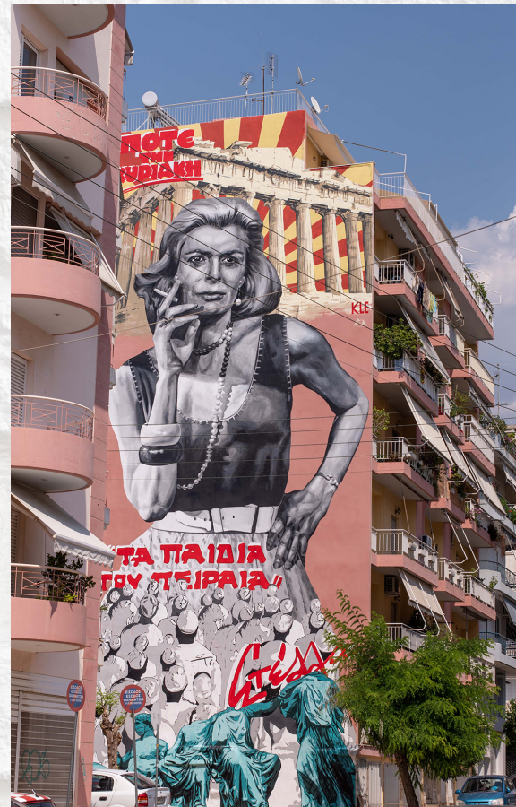
Melina Merkouri's Portrait in Patras Art Walk 5