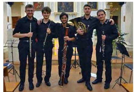
Il Quintetto di Fiati del Conservatorio F. Morlacchi, aka Perusia and Friends: Quintetto Perugia-New York-Belgrado.

Una delle occasioni più belle del mio soggiorno è stata quando al Conservatorio di Musica io ed i miei amici abbiamo creato un quintetto di fiati che si chiamava "Il Quintetto di Fiati del Conservatorio F. Morlacchi" o come l'abbiamo chiamato sempre fra noi "Perusia and Friends: Quintetto Perugia-New York-Belgrado" perché i membri del gruppo erano di nazionalità italiana, serba e statunitense (ed abbiamo intenzionalmente inserito il nome latino della città). Siamo stati selezionati per suonare al Festival dei Due Mondi a Spoleto, uno degli avvenimenti culturali più prestigiosi in Italia, nel quale, per tre settimane, ogni estate vengono organizzati diversi concerti di musica classica e popolare, spettacoli di danza, opera e teatro, mostre d'arte e conferenze culturali e scientifiche. Abbiamo suonato nella piazza del mercato in pieno centro città. C'era tanta gente per strada e seduta ad ascoltare il concerto.