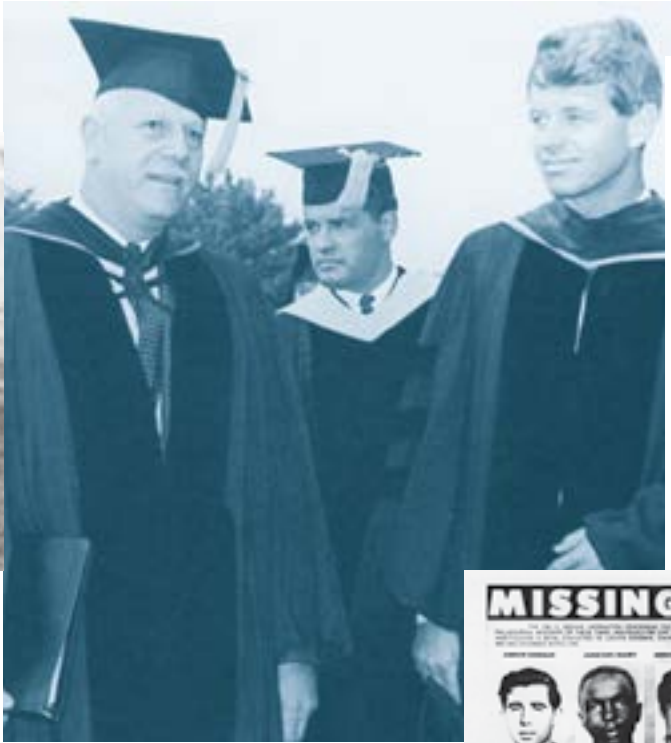
Addressing issues: Robert Kennedy (far r.), New York State's new junior senator, speaks at Commencement 1965.

'60: Dress code imposed on women students: no shorts, slacks, or "similar attire." (It will be rescinded in 1967.) Smoking no longer permitted in classrooms. '61: Dedictory concert for Colden Center performed by the New York Philharmonic. The City University of New York is founded. '62: College celebrates