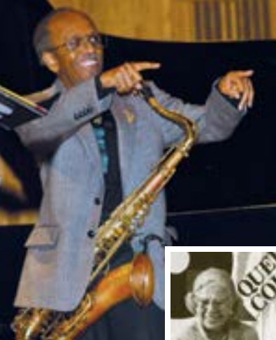
Sax educator: Jimmy Heath