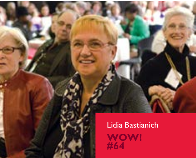
Lidia Bastianich WOW! #64