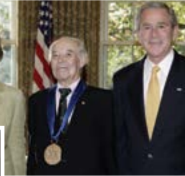
Found in translation: Laura and George W. Bush flank Gregory Rabassa.