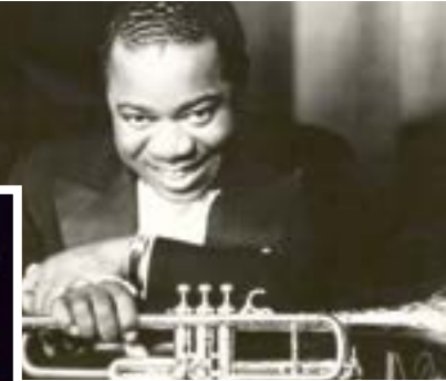
Banding together: In photo at left, Senator Chuck Schumer (2nd from l) and First Lady Hillary Clinton (far r.) back efforts to preserve the archives and home of Louis Armstrong (above).