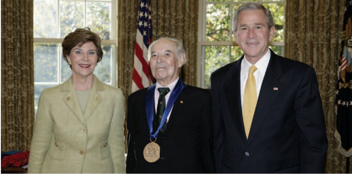
Gregory Rabassa at the White House in 2006 with Laura and President George W. Bush after he received the National Medal of Arts.