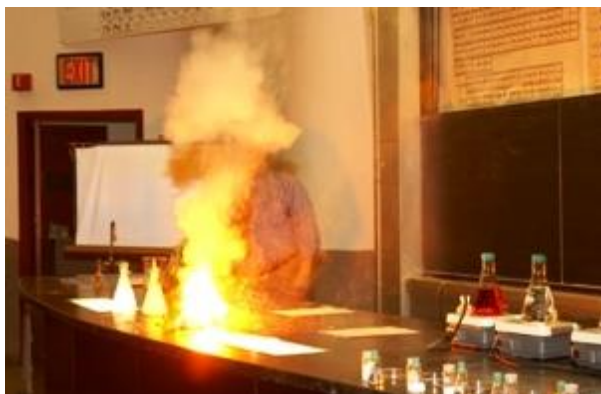
Flower on flame when water was added! Chemical Magic.