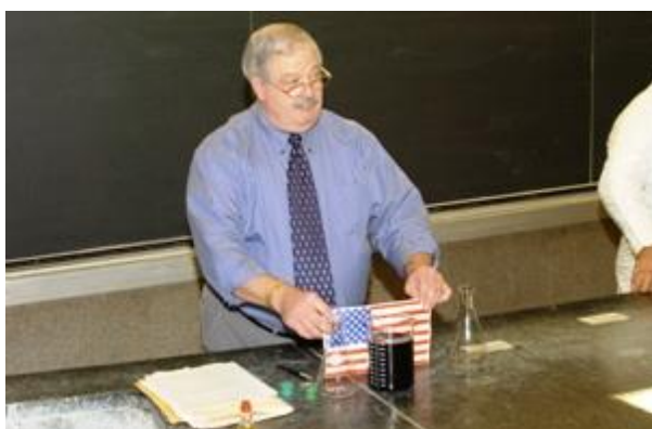
A colorless solution responds to American Flag?