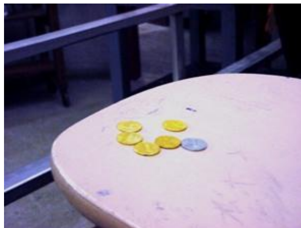
Gold and Silver Pennies for Sale.