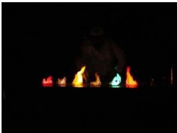
Colorful lights glowing in the dark.