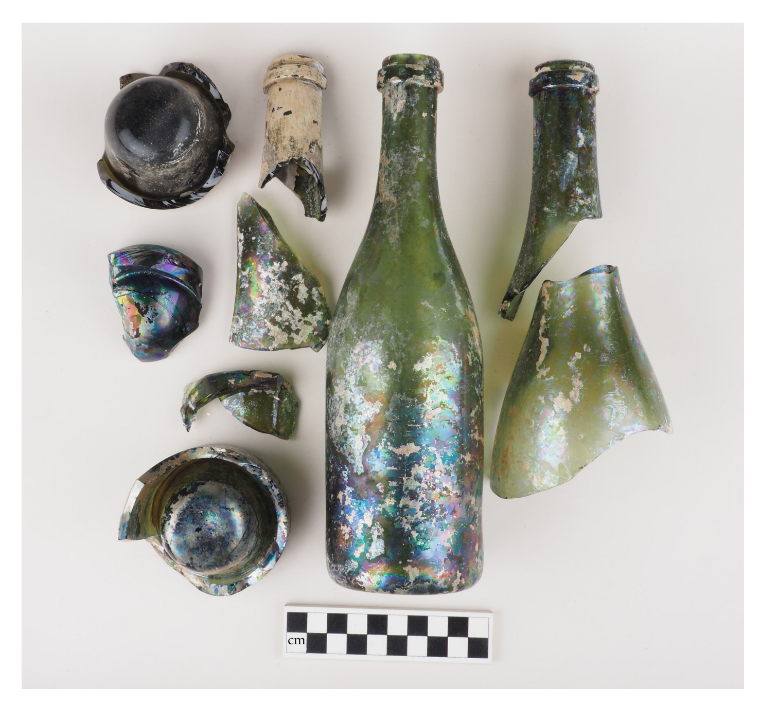
FIGURE 2. French Champagne Bottle and Bottle Fragments Recovered from Highland City.