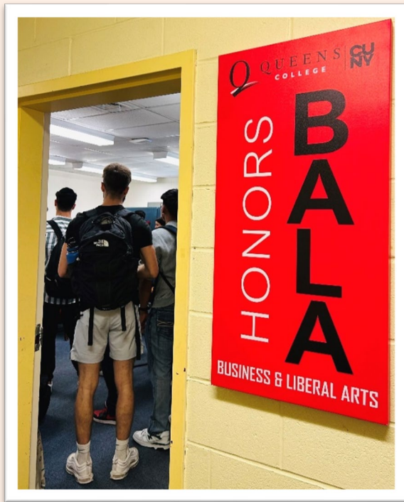
BALA Welcome Back - Standing Room Only