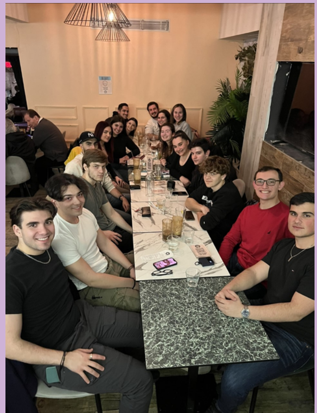
Cafe night with current and former club members

In person: Student Union Room 219 Follow on Instagram: @ikaroshellenicqc