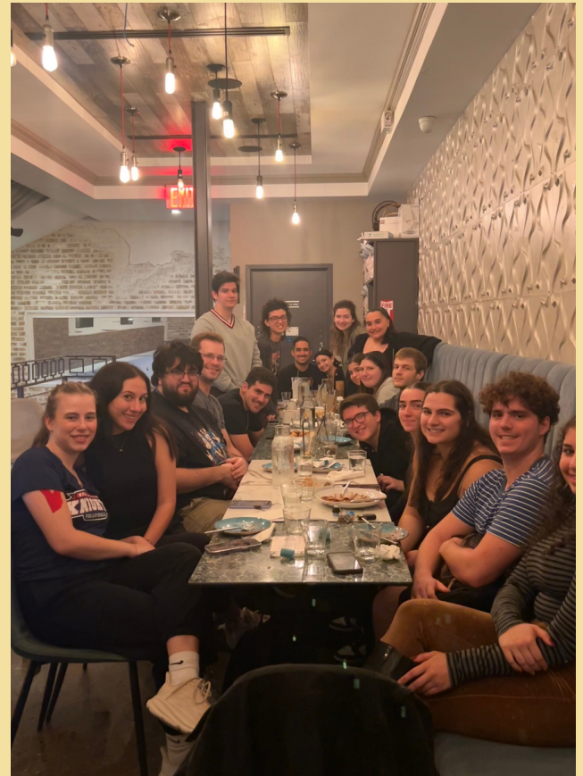
Cafe night with Greek Club members

November (TBA) Visit to Adventure Park at Long Island