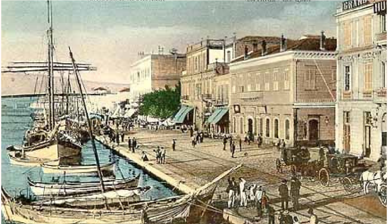
Image: Smyrna, Greek Postcard https://commons.wikimedia.org/wiki/File:Smyrna.JPG Unknown author, Public domain, via Wikimedia Commons