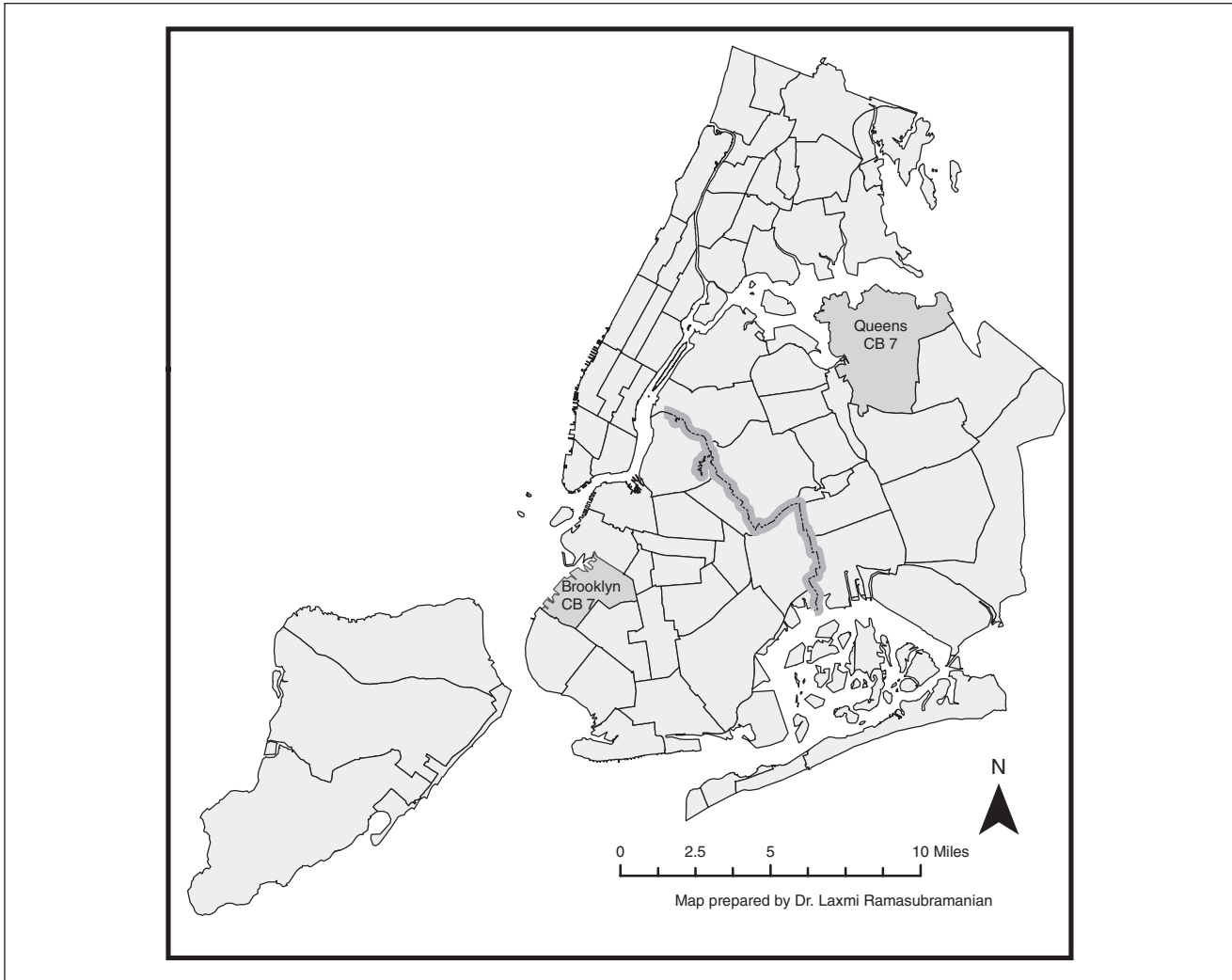
Figure 1. New York City community boards Map prepared by Dr. Laxmi Ramasubramanian.

it mediates between the powerless street based neighborhoods and the all-powerful city. The political infrastructure of NYC includes fifty-nine district-level community boards, the most decentralized or local body of urban governance. As district-level entities, community boards are seen as venues for formalizing local everyday concerns and elevating these issues to the city level for political action and/or policy formulations. Evolving from community planning councils of the 1950s, community boards became a part of municipal government through a 1975 New York City Charter provision that formalized citizen participation in the public review of land use and zoning amendments. Community boards review development proposals and their decisions to reject or support zoning changes are officially part of the city's Uniform Land Use Review Procedure (ULURP) along with the City Planning Commission, borough presidents, and City Council. Subsequent to 1975, revisions to the New York City Charter expanded the powers