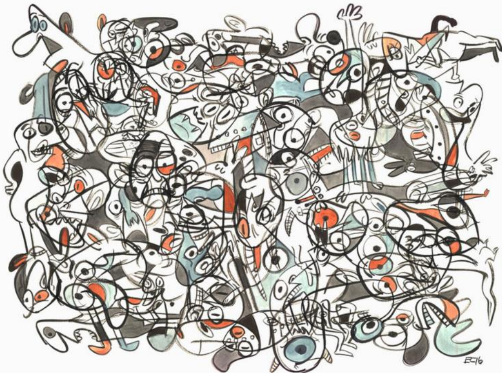
Exhibit: Design Faculty at Queens College