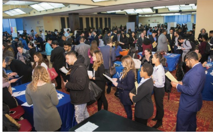
Scenes from the March 13 Career and Internship Fair.