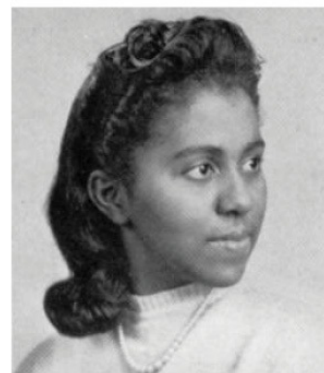
Marie Maynard Daly

In other news, the council voted unanimously to rename PS 211 after a QC alumna and Corona native who was the first African-American woman in the United States to receive a doctorate in chemistry. Henceforth, the school will be known as the Dr. Marie M. Daly Educational Building.