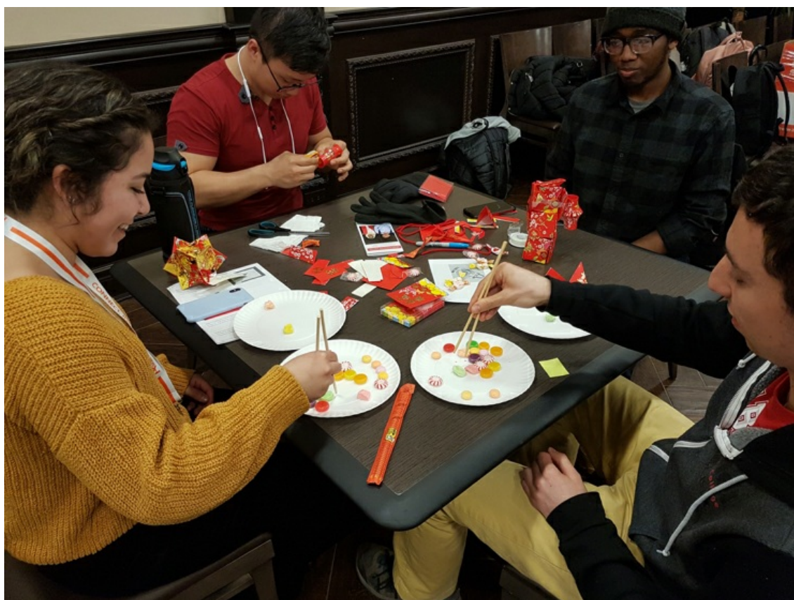
Students displayed their manual dexterity when the QC chapter of Ascend belatedly marked the Lunar New Year of the Rat with a Red Envelope Lantern meet-and-greet on the evening of Thursday, February 20, in the Q-Side Lounge. During the first half of the event, students made lanterns out of red envelopes, which are traditionally given by elders and married couples to younger family members. The envelopes contain money, to wish the recipient good fortune and luck. Friends also exchange envelopes. In the second half of the event, contestants had to use chopsticks to pick up and transfer as many candies as possible from one plate to another in 30 seconds. The top three